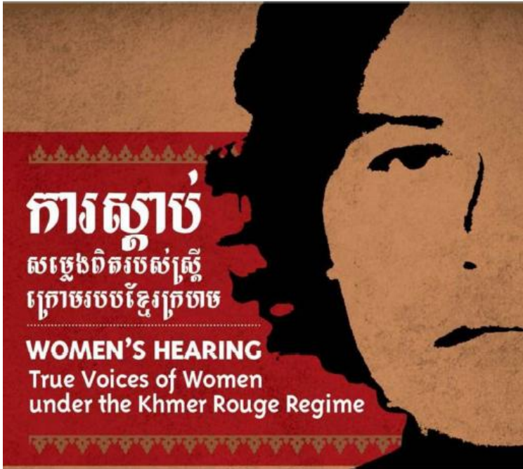
Flyer, Women's Hearing 2011, CDP GBV Project

Finally, the project has triggered interest among NGOs, especially those involved in ECCC-related activities. Some organizations have put information about GBV during the KR on their website or disseminated information to their constituencies. The project has also contributed to knowledge of GBV during the KR by documenting and publishing stories of victims of GBV during the KR.