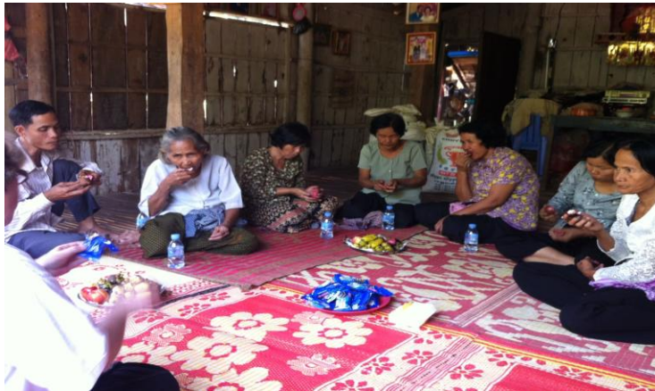
Group discussion, February 2013.

The evaluator conducted two group discussions and seven individual interviews with CDP clients. The project staff was responsible for contacting and organizing interviews with their clients. The interviews were conducted in English with translation in Khmer. There were two Khmer female interpreters. The first interpreter did the translation for the group discussions and four individual interviews. The second interpreter assisted in the three remaining interviews. The choice of female interpreters was deliberate so female interviewees would be more at ease during the interviews. The evaluator met and briefed the interpreters on the project prior to their first encounter with the clients.